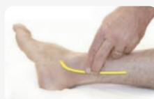
Sural (sensor only)